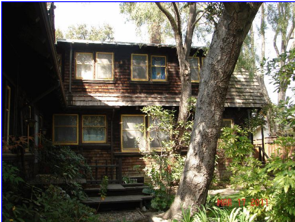
6) The southeasterly elevation of the northeasterly wing