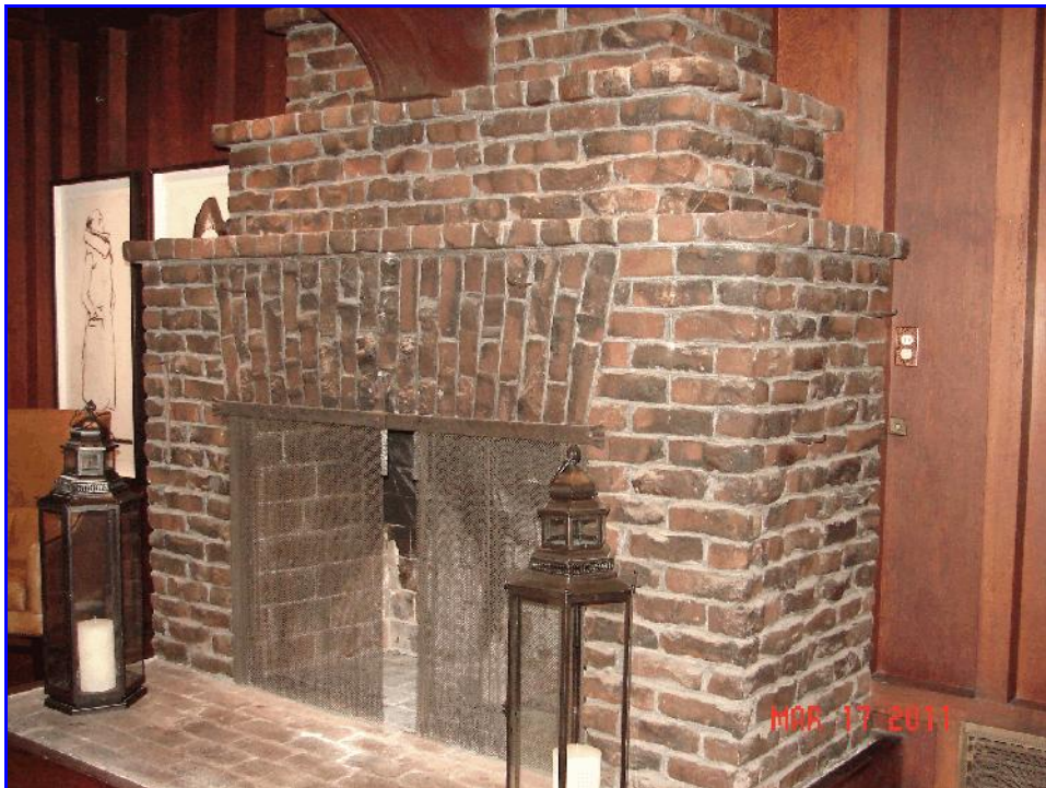
18) The parlor fireplace