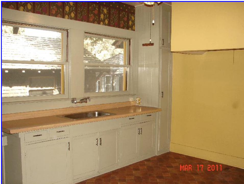
20) The former rental unit kitchen on the ground floor