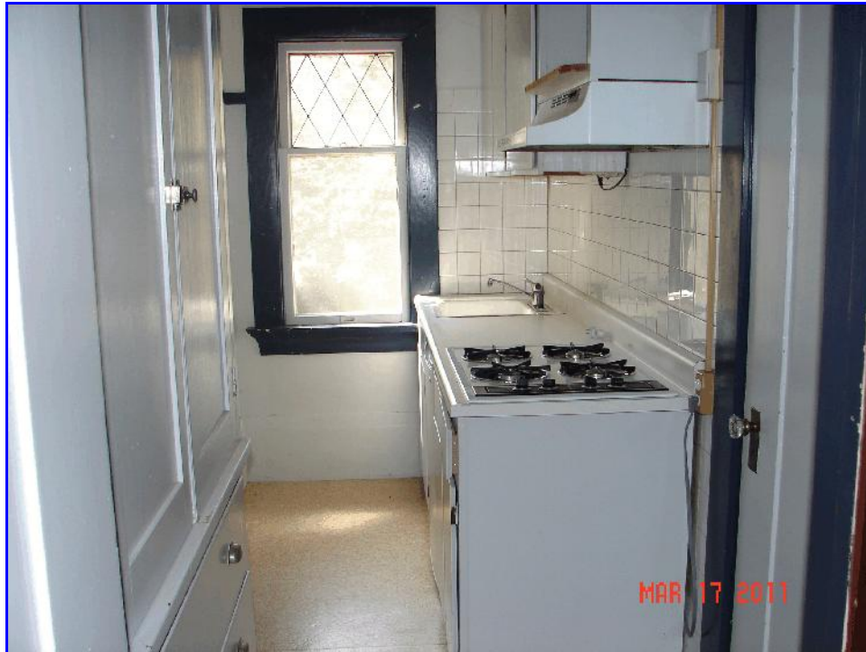
21) The kitchenette of a former rental unit on the second floor