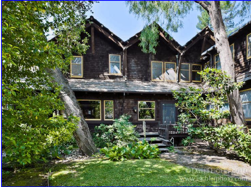
7) A southwesterly view of the easterly elevation