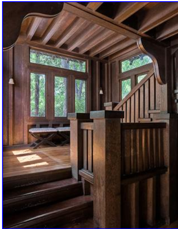
12) The staircase from the parlor to the second floor