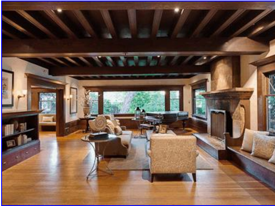
13) The living room