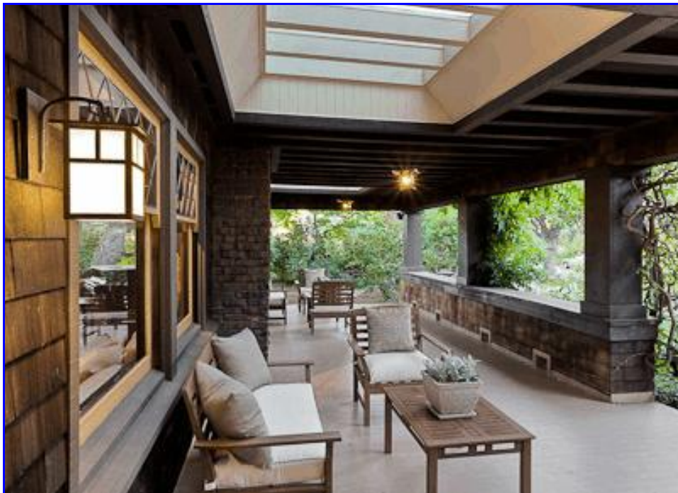
8) A view across the front porch