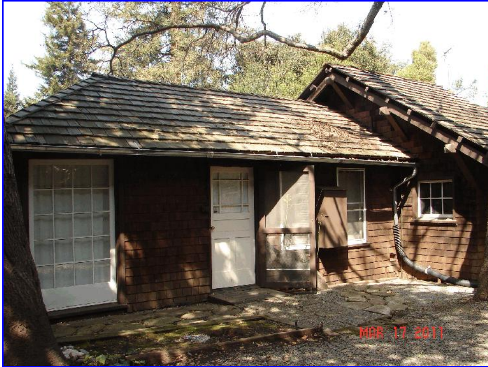
9) The cottage