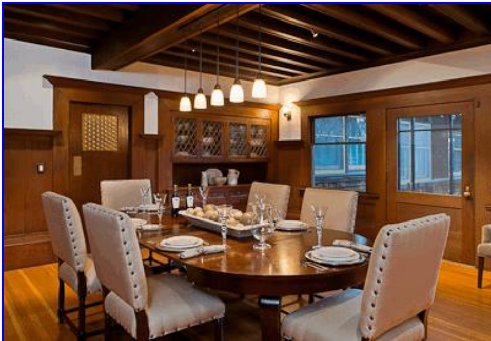
16) Another view of the dining room