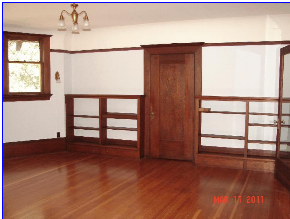
22) A second floor bedroom