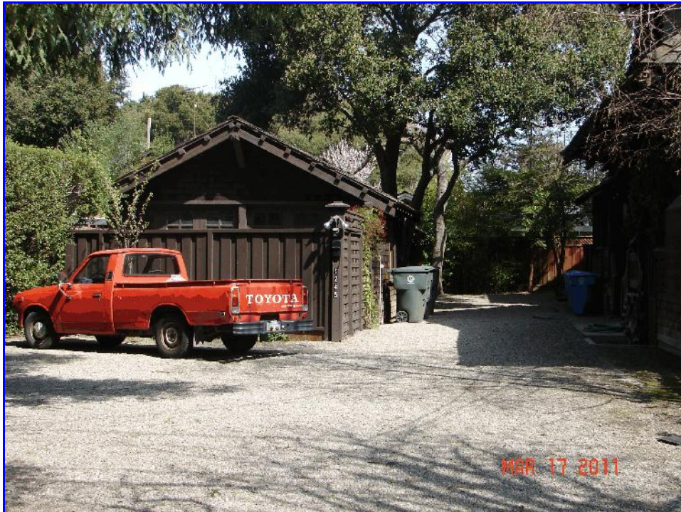
10) The garage, driveway, and uncovered parking area