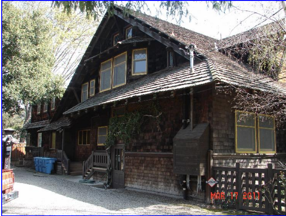
5) A northeasterly view of the northwesterly elevation