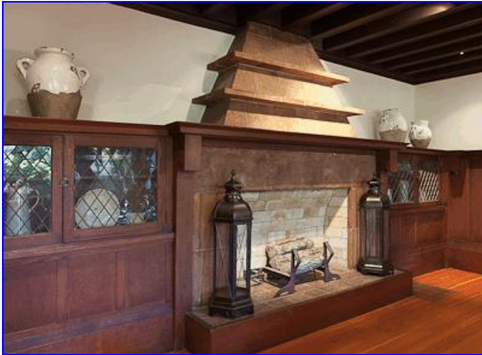
17) The dining room fireplace and cabinets