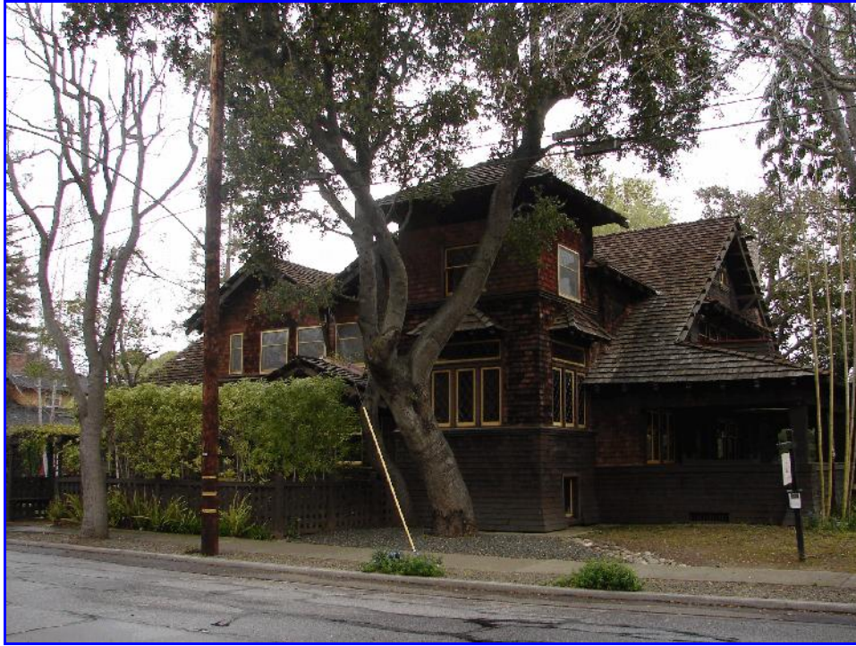
3) A northerly view of the southwesterly elevation