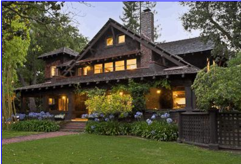
2) 601 Milton Avenue in the early evening