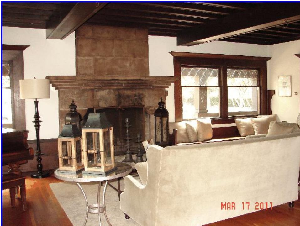
14) The living room fireplace and seating area