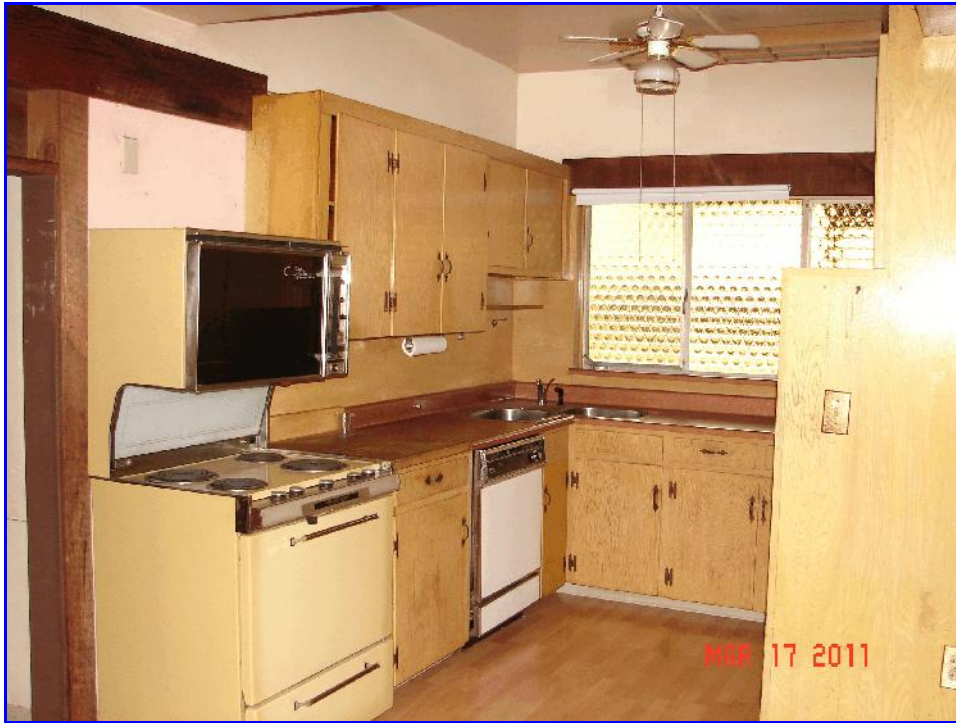
19) The main kitchen on the ground floor