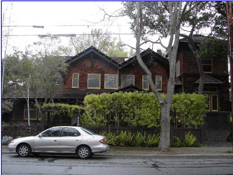
4) A northeasterly view of the southwesterly elevation