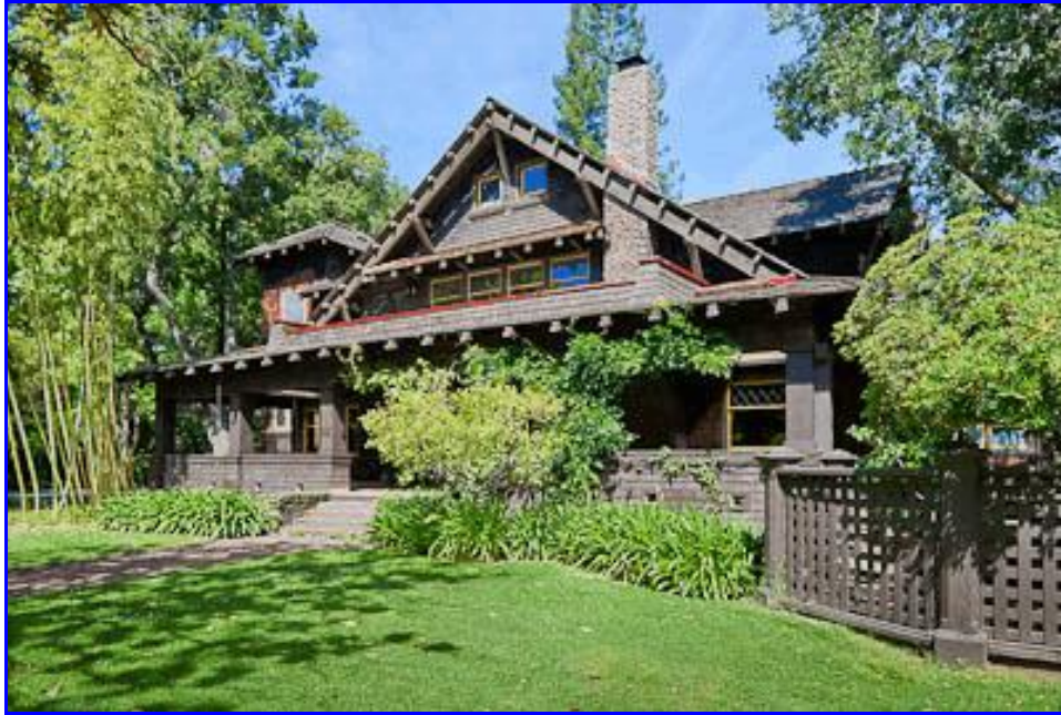
1) A view of subject from the Milton Avenue frontage