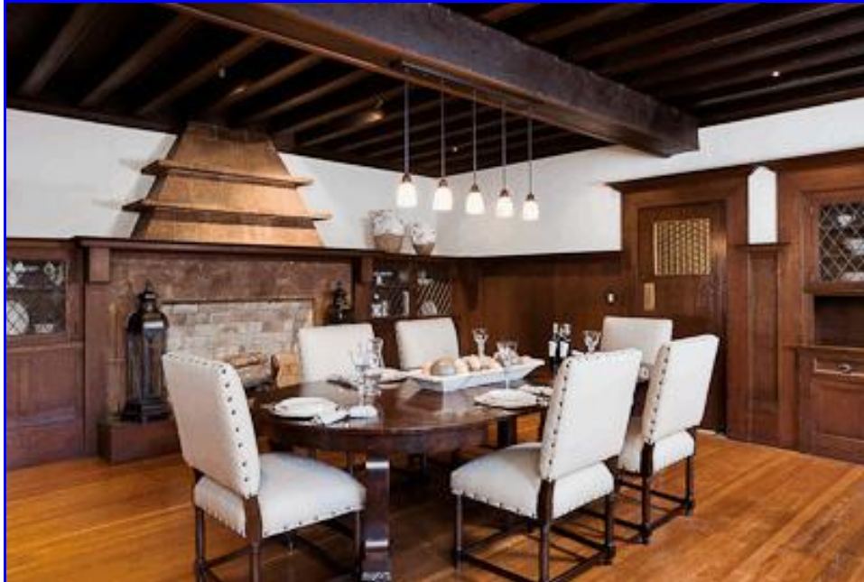
15) The dining room