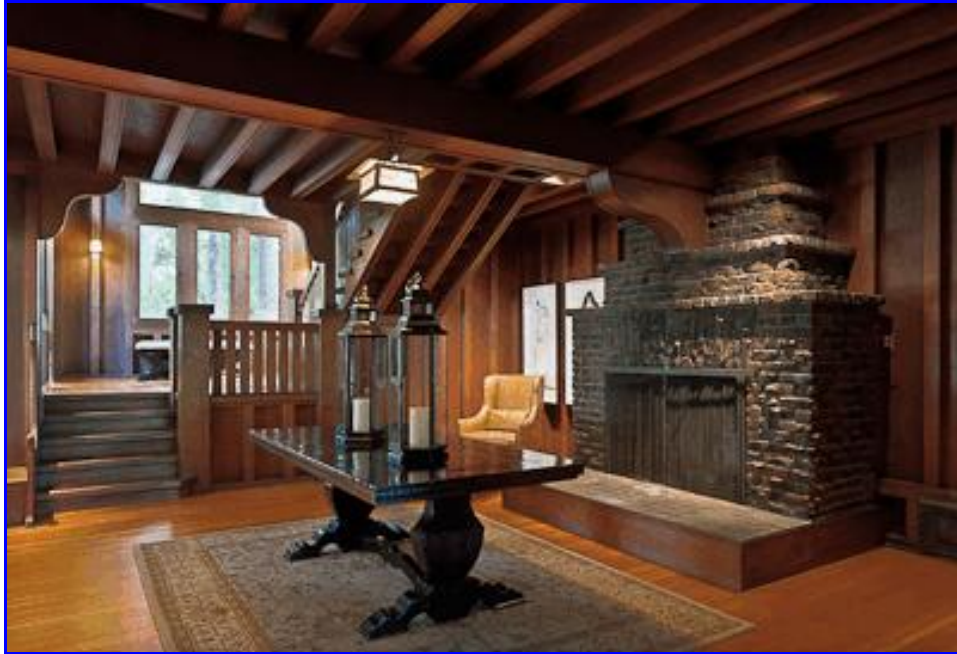
11) The parlor or entry hall